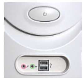
Front USB & on/off switch