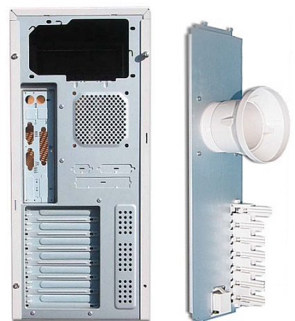
Back view & Metal bar