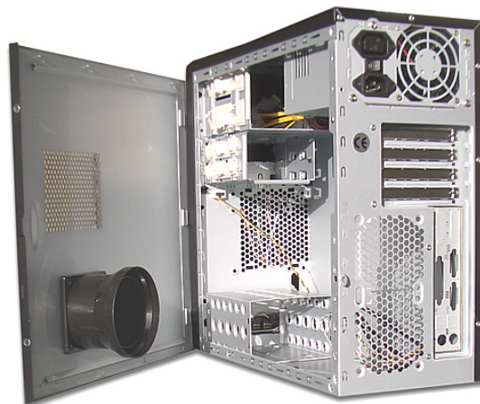
Inside & back view