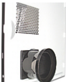
CPU air duct (ATX version)