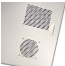
Vent holes (ATX version)