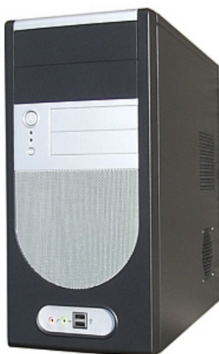
KM3389BS (Silver mesh)