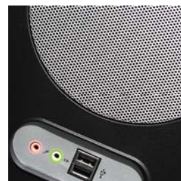
Front Mesh & Air filter