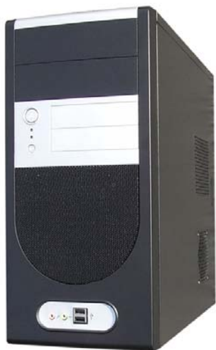
KM3389BB (Black mesh)

3 fan space, CPU air duct, Side vent holes for an outstanding ventilation.