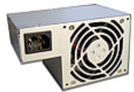
BTX 275W PSU. SATA, 24 pin