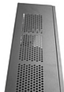
Vent holes on both sides.