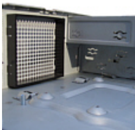
Front air duct drags cool air directly on CPU.