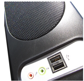
Front USB & Audio, Mesh.