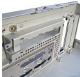
Back PCI slots & vent holes