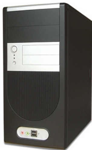
KMB3389BB (Black mesh)