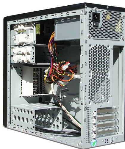
Inside & back view