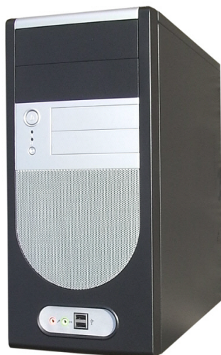
KMB3389BS (Silver mesh)