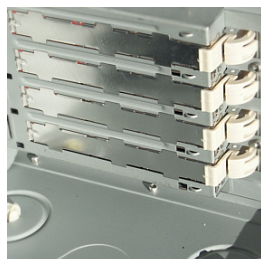
PCI card holders